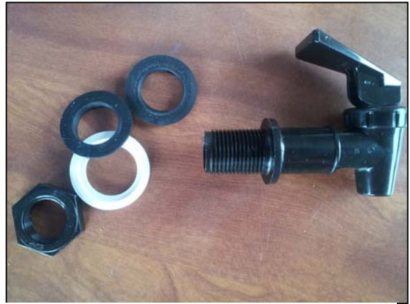
Flip-up faucet that can be retrofitted to your thermos.