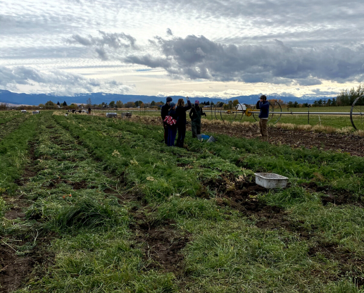
Community Carrot Pilot Project (MFEI) Bozeman