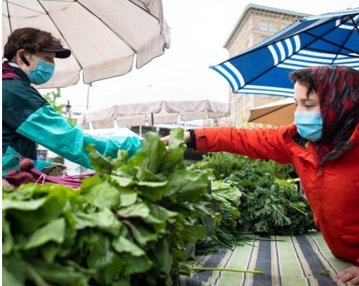
Clark Fork River Market, Missoula