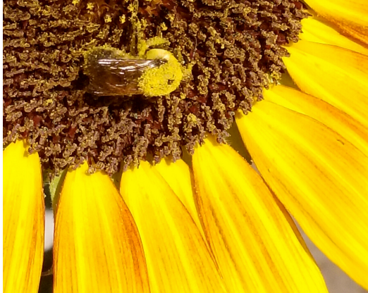
Happy pollinator at community garden